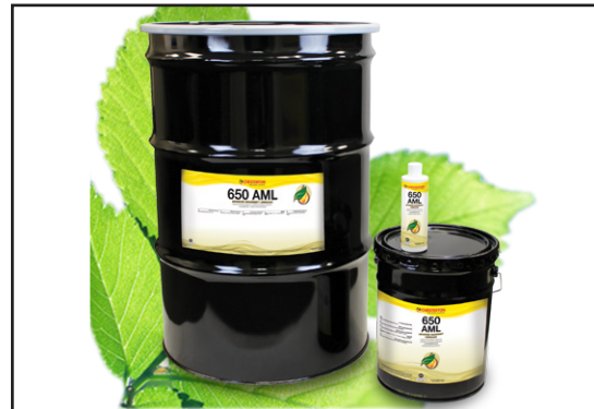
Chesterton 650 AML Lubricant.

650 AML penetrates extremely well inside the micro spacings of the chains and can carry high loads. It avoids build up due to high detergency and higher operating temperature limits.